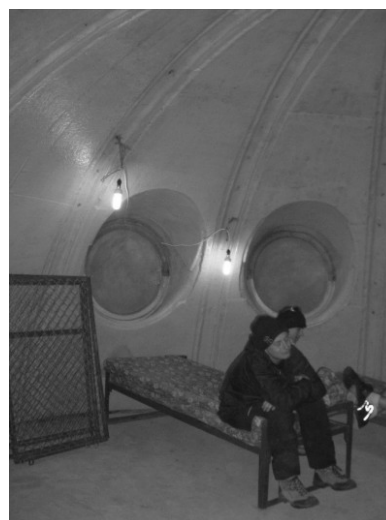
Raleigh venturers inside the igloo

Nevertheless we had lots of fun and I am looking forward to meet the next venturers in June, when we will continue to map areas south of the Baker's Bay seal colony.