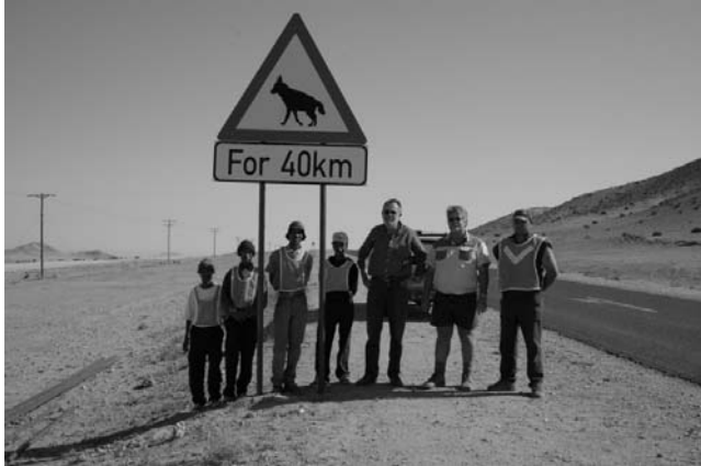
Brown hyena warning sign at Haalenberg.