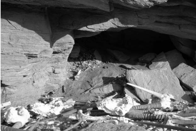
Brown hyena den site at Münzenberg.

As unlucky as we were in finding the GPS collared hyenas around the Kaukasib study site, the more luck we had during our first mapping trip. We met the Raleigh International venturers at Trygve's camp near the Kaukasib fountain. We decided to concentrate our mapping efforts on mountains and decided to walk the Münzenberg and Tsabiams mountain areas.