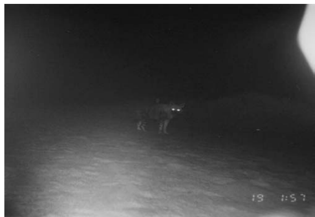
Brown hyena captured by the camera trap at Anigab.