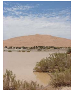
Water in the Koichab

We also would like to fit brown hyenas in the same study area with GPS collars to find out how both hyena species interact. Therefore we are urgently looking for funding, so if anybody has an idea or would like to contribute to this study, please contact us.