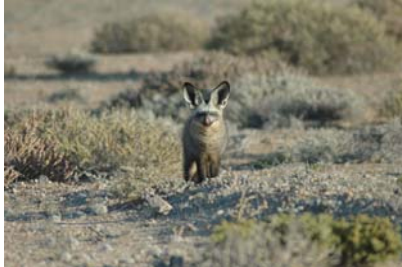
Bat-eared fox near the Black Mountain