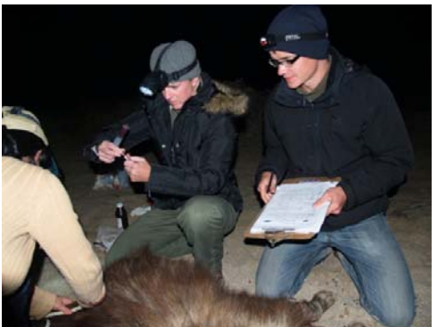
LHb34m, the sub adult. A beautiful male. (3) With Dawn, Corin and LHb34m

Our camp on Atlas Bay suffers the attack of a gang of hyena cubs and jackals! When we arrive to the camp very early on the morning, after a darting night, we saw a hyena cub running away from the kitchen tent and also a couple jackal's playing with toilet paper! After two tents destroyed, we move the camp to Wolf Bay. We test our luck on the Greenhouse galley, but we only feed sub adults hyenas and jackals. One night we share an entire night with two sub adults, the LHb34m and his sister. Was an amazing experience!